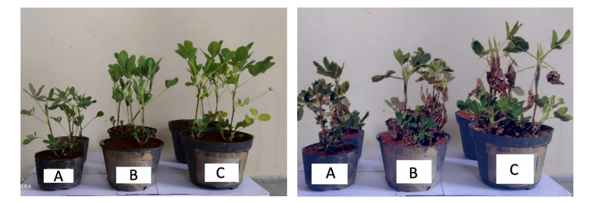
Figure 1. Mono-crop Peanut grown in A) small B) medium C) large soil volume on (left) 4<sup>th</sup> and (right) 7<sup>th</sup> week after planting (WAP)

Choy sum developed similarly to peanuts in terms of growth and toxicity, but the effect of the neighbouring plant was more visible. Choy sum in mixed-cropping was smaller than their monocultured in respective soil volume. They are more similar in size to the mono-cultured one volume below them. Regarding toxicity, smaller volumes, and mixed cropping produce healthier plants rep-